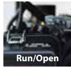
4 Recoil Start