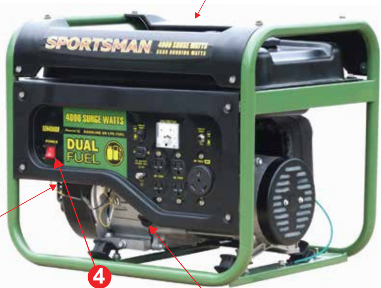
3 Add Gasoline