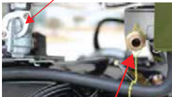
LP Gas Inlet (Figure B)