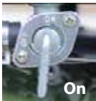
Fuel Petcock (Figure A)