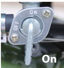
Fuel Petcock (Figure A)