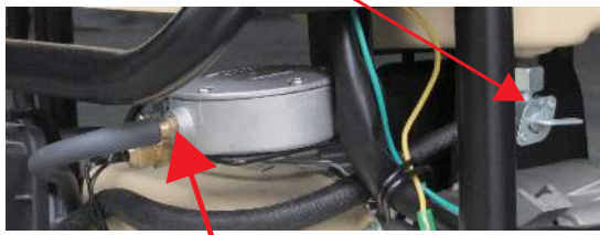
LP Gas Inlet (Figure B)