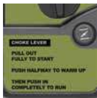
Choke (Figure B)