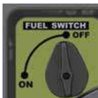
Fuel Switch (Figure A)